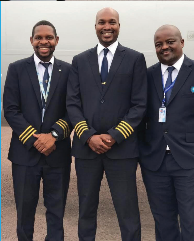
Our professional flight crew