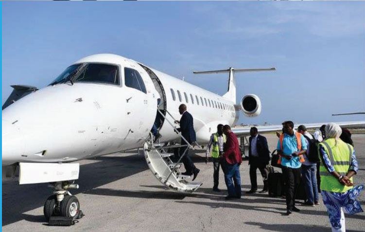
Passengers boarding the aircraft in Nairobi

As of December of 2018 ALS partnered with Kenya Airways to operate scheduled daily flights between Nairobi and Mogadishu, Somalia.